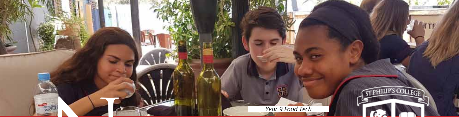
Year 9 Food Tech