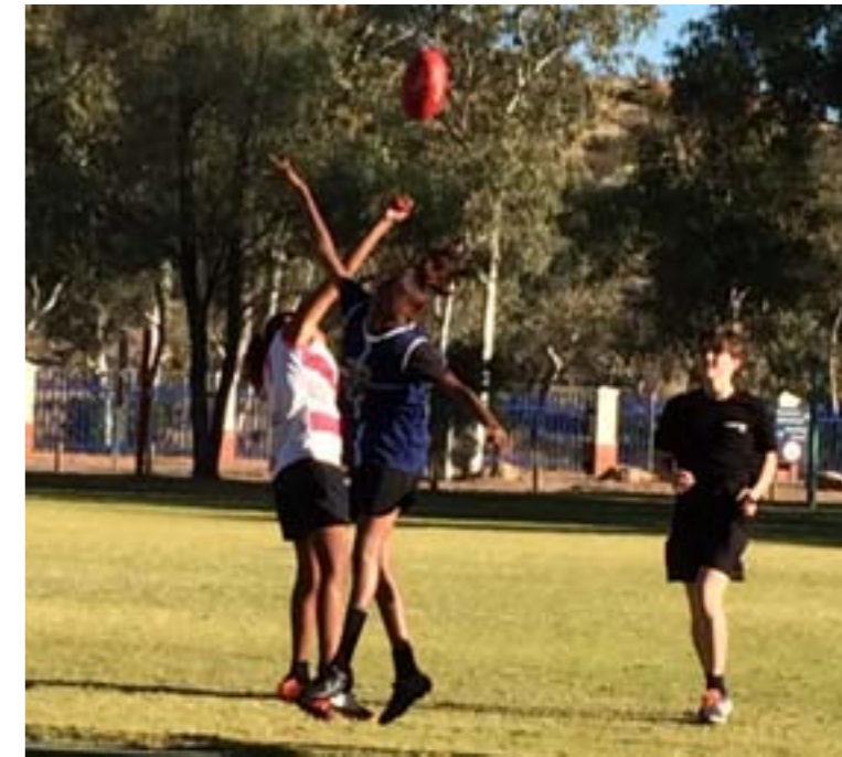
Action from the Bentley Trophy (above)