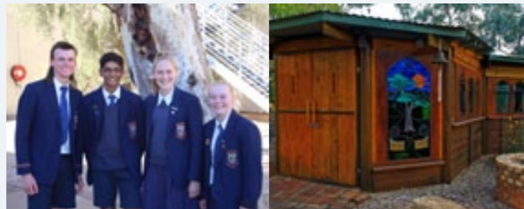
Year 12 Leadership Breakfast 7:00am, Fred McKay Education Centre