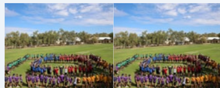
Round Square Breakfast