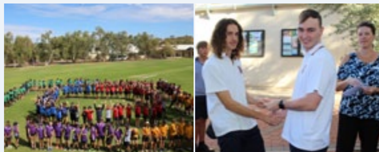
Round Square Action 3.15pm