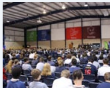
Topsy Smith House Assembly