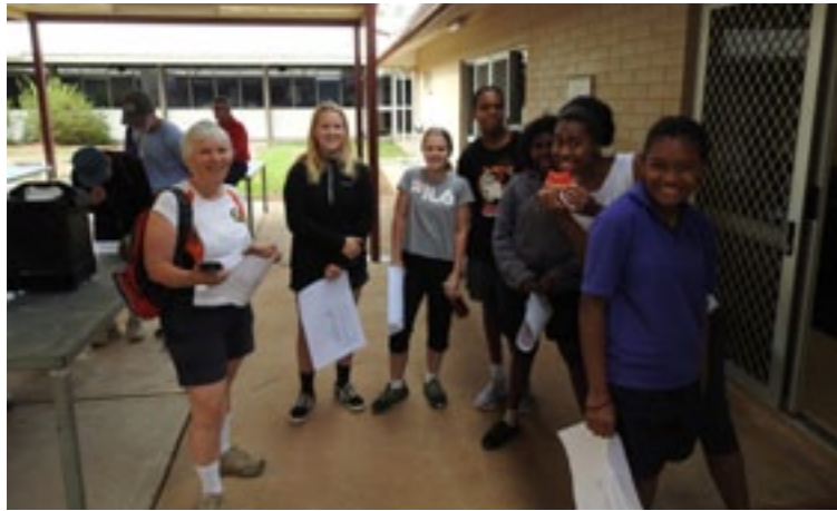
Above: Happy orienteers ready for the start. Below: Sunrise on Spencer Hill