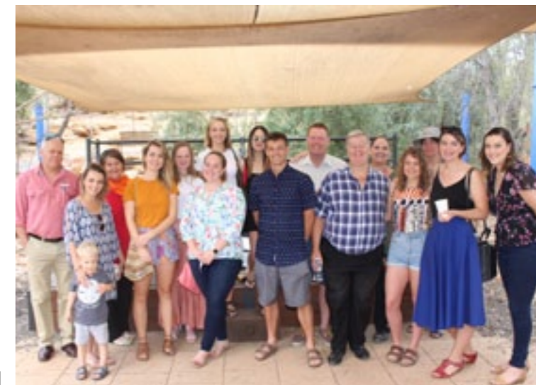
Above: Group photo from Sunday morning Chapel Service and Bush Breakfast

We now look forward to next year's event where we will be calling all from the Class of '99 and the Class of '09 and any others to come and enjoy themselves as much as the Old Saints this year did!