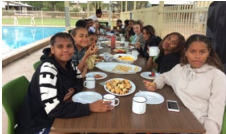
Above: Lots of yummy food at the pool party Below: The water was still warm despite the rain.