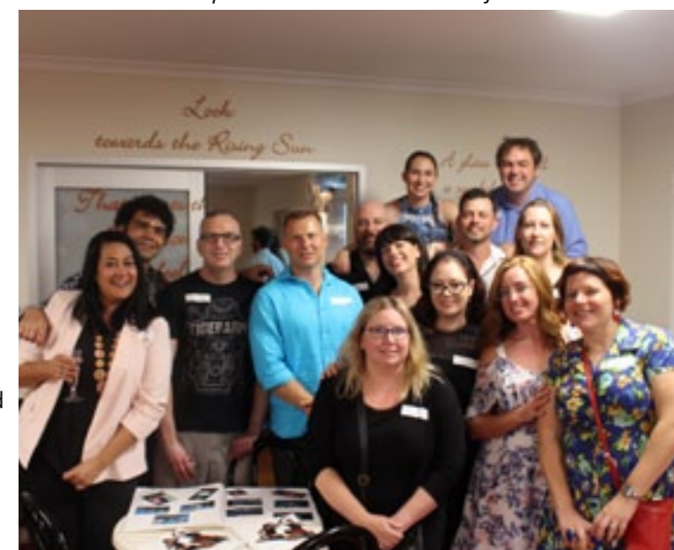
Above: Class of '98 group shot Below: Class of '08 group shot