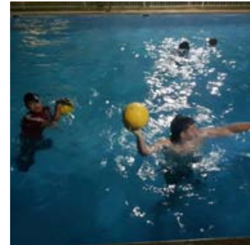
Above: Boys playing Water Polo Below: Design for the new Boys' Boarding Shirts