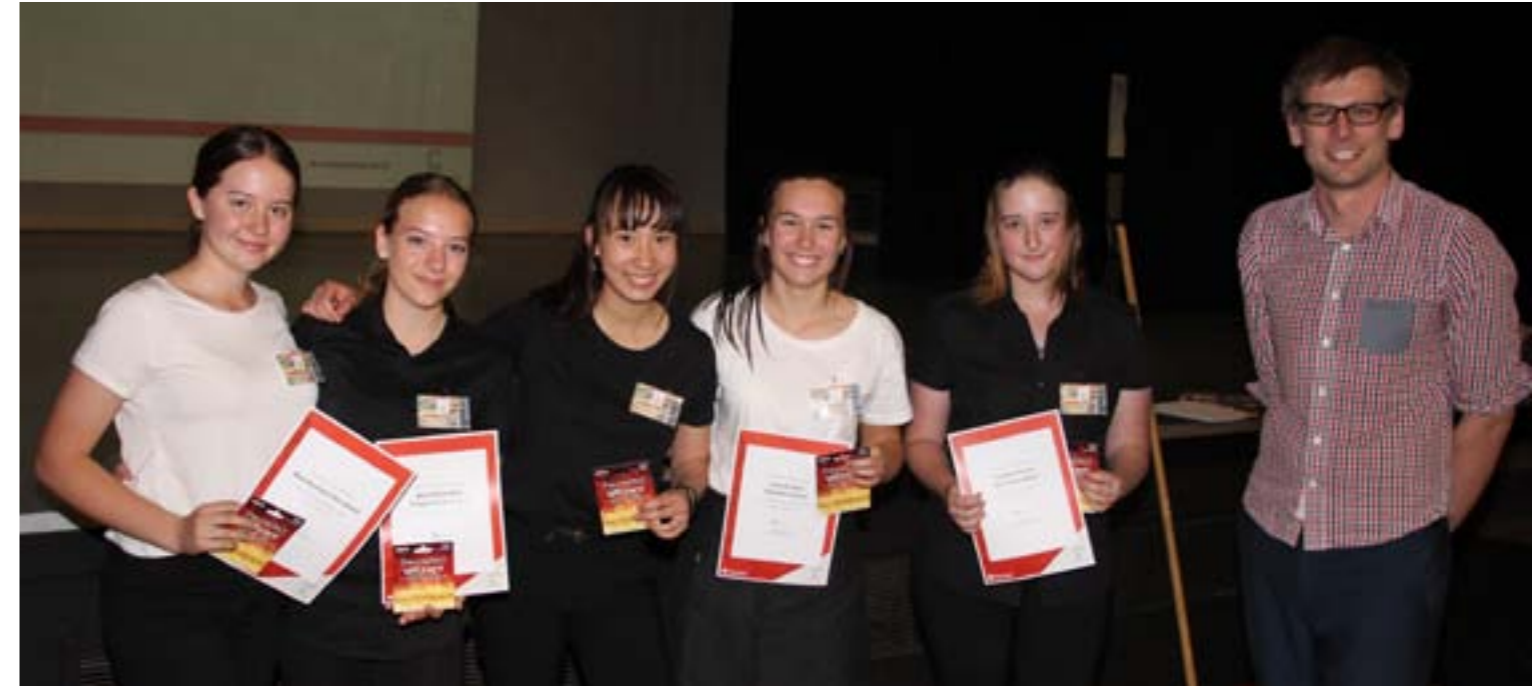
Above: Overall Best Business - Feel Good Food Below: Runner Up Best Business - Lifes Best Friend